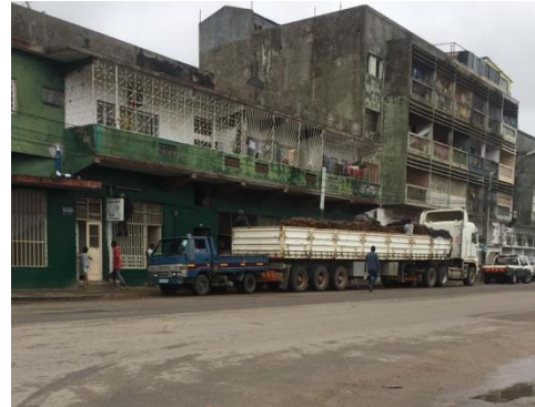
Zimbo Truck in Beira

The country should focus more on exports than imports. Even locally available goods are being imported and the big question is WHY.