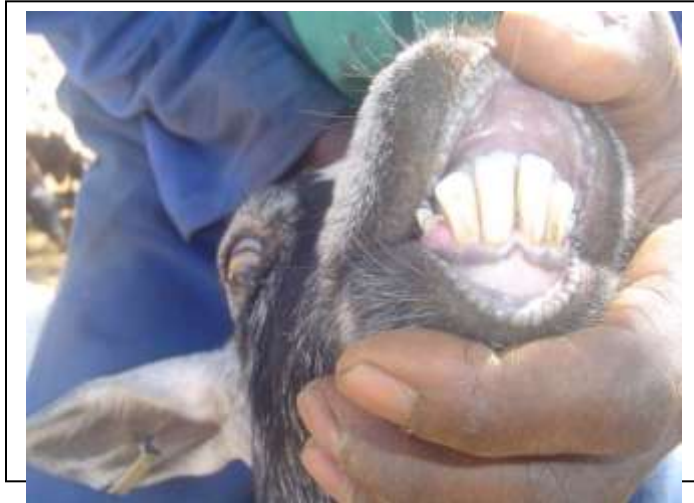
Four tooth stage