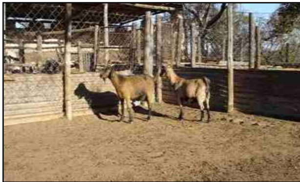
Female goats (does) separated from the main flock

Pregnant females should be separated from the main flock for close monitoring, at least two months before kidding. This also reduces the loss of kids. At this stage they will need quality feed supplements to enhance feed reserves in the body. This will ensure a healthy kid and enough milk.