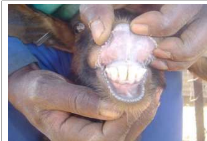
Six tooth stage